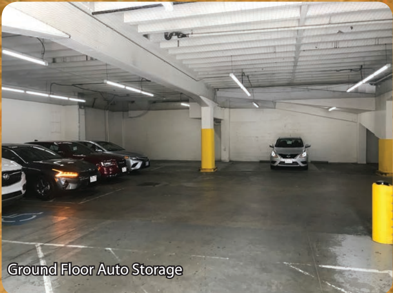
Ground Floor Auto Storage