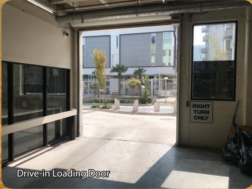
Drive-in Loading Door