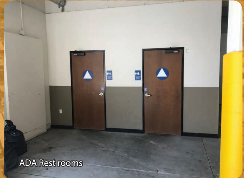
ADA Rest rooms